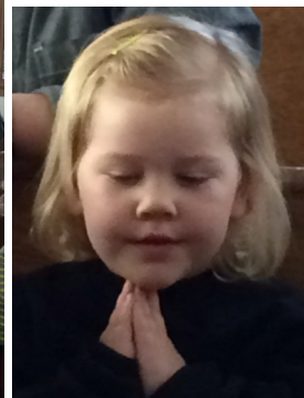
Children’s Learning Center Chapel Time