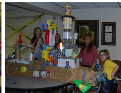
Construction Night at LOGOS